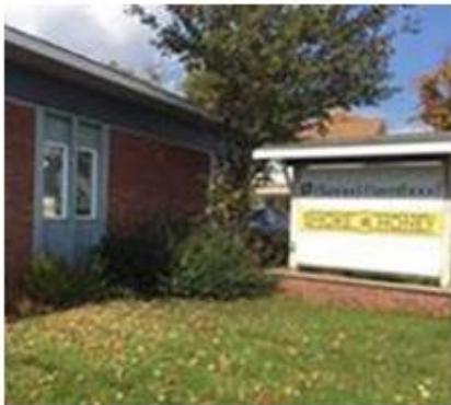
Front of Office from State St.

The ENCOMPASS office, suite A, is all the way at the top of the ramp and all the way to the right. After entering the office, please have a seat in the waiting area and your EAP professional will be with you shortly. As a courtesy for other clients using the services – please do not knock on closed doors.